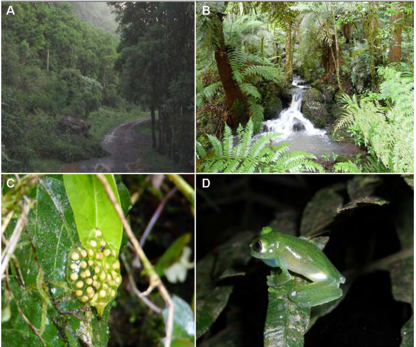
FIGURE 2. (A) General vegetation of the area, (B) Small stream habitat (C) Ovoposition on leaves and, (D) Male of Vitreorana uranoscopa from Área de Proteção Permanente da Pequena Central Hidrelétrica de São Marcos, Rio Grande do Sul, Brazil.